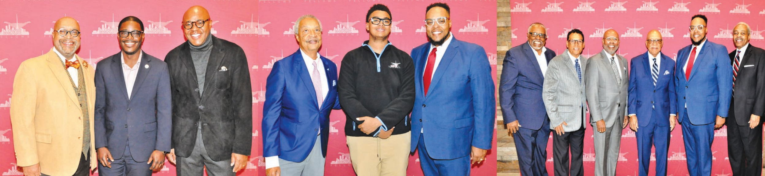
(continued from front page)